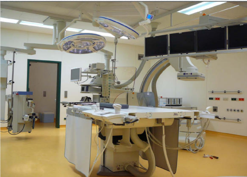
Cardio-Centre Dresden / Germany Ceiling Supply systems for OT