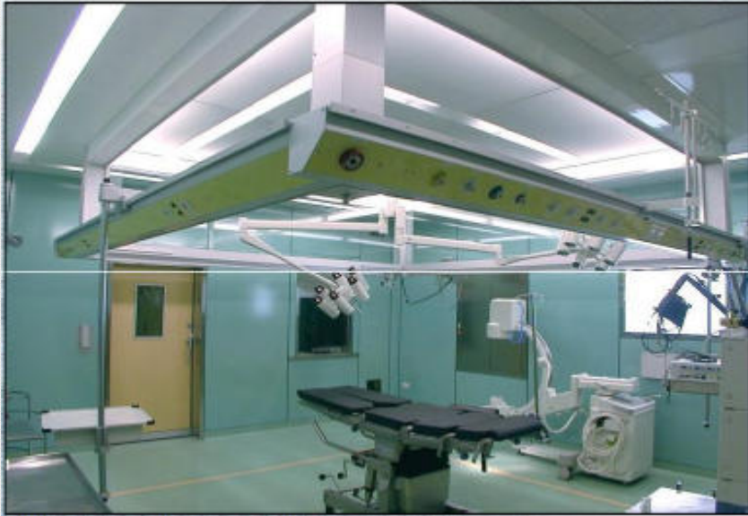
Cardio-Centre Dresden / Germany Ceiling Supply systems for OT